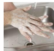
Right palm over back of left hand and vice versa