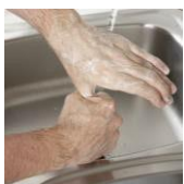
Rotational for thumbs