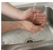
Wet your hands

The hand washing process should take at least 30 seconds, between fingers, wrists, nails and thumbs. Remember to dry your hands thoroughly afterwards. Disposable paper towels must be used (tea towels and cotton towels harbour bacteria).