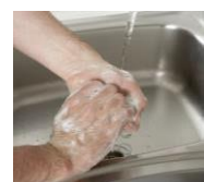
Backs of fingers