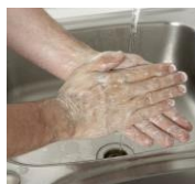
Rub your hands together and work the soap in